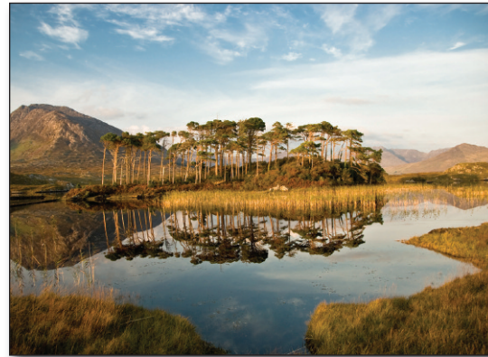
Pine Island of Derryclare Lake on a still day.