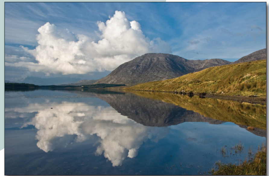
Lough Inagh has plenty of places of beauty to photograph, however a nice cloud pattern can add to the scene on a still day. Inagh Lodge is evident on the horizon.