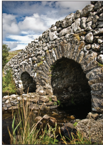
The arches of the Quiet Man Bridge, show some detailed masonry.