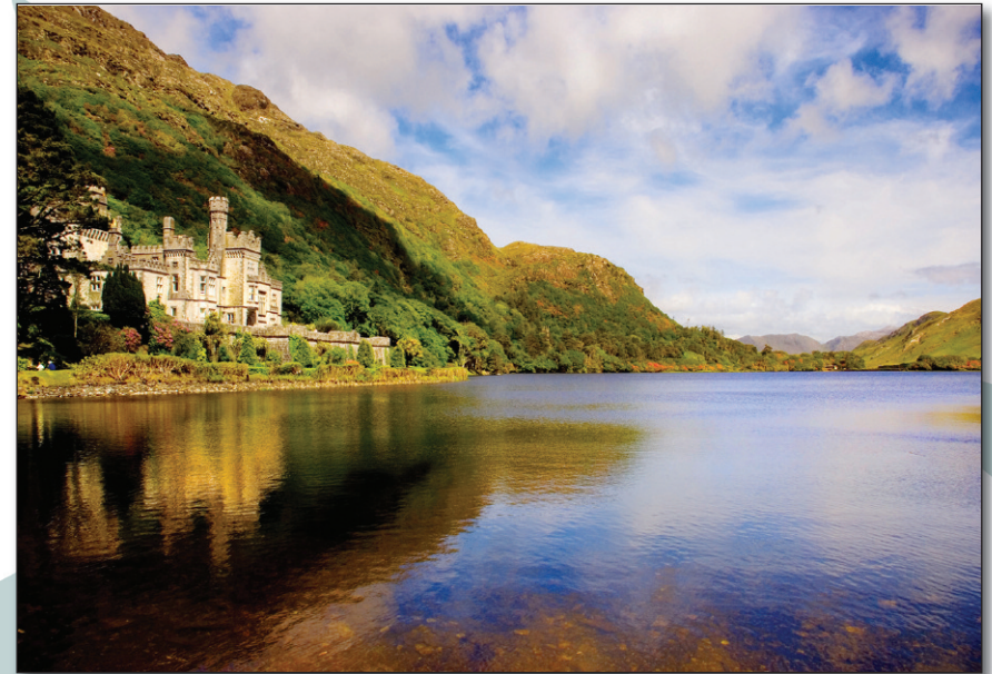
Kylemore Abbey, always a popular spot in Connemara, is well worth a visit, as it towers over a still lake.