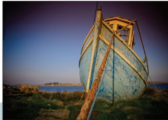
A Roundstone boat takes some rest on dry land.