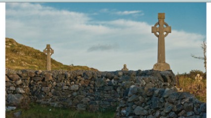
Ballynahinch also possesses a small church with a graveyard which has some high cross gravestones that rise above the horizon reaching for the sky. Opposite page: Close to Ballynahinch lake, is a sign for 'The Ranch' and behind the sign is this breathtaking view which shows how Connemara can fill a frame.